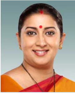
Ms. Smriti Zubin Irani