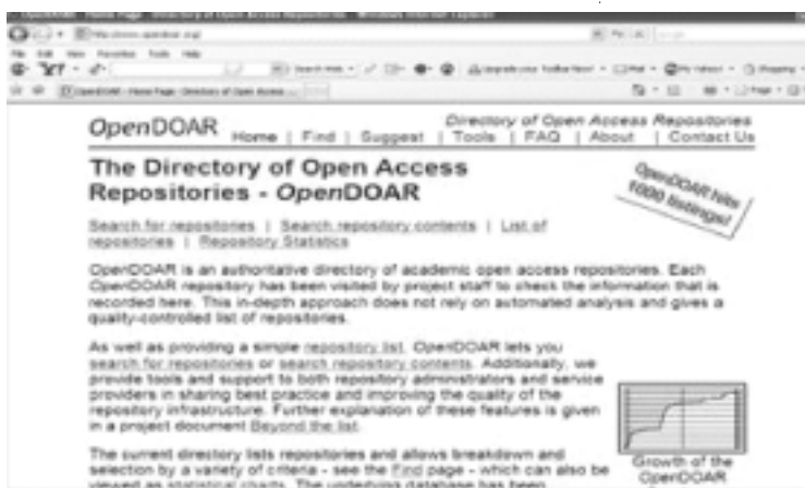
Figure 3 Open DOAR Directory of OA Archives

There are many value added services which index OA archives spread globally, as well as harvest metadata records for search and retrieval. OpenDOAR, the Directory of Open