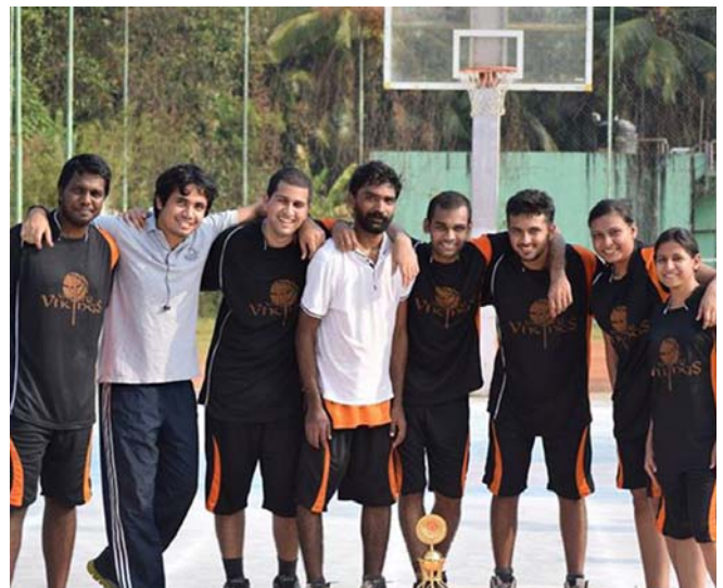
KBL Champions Valley Vikings