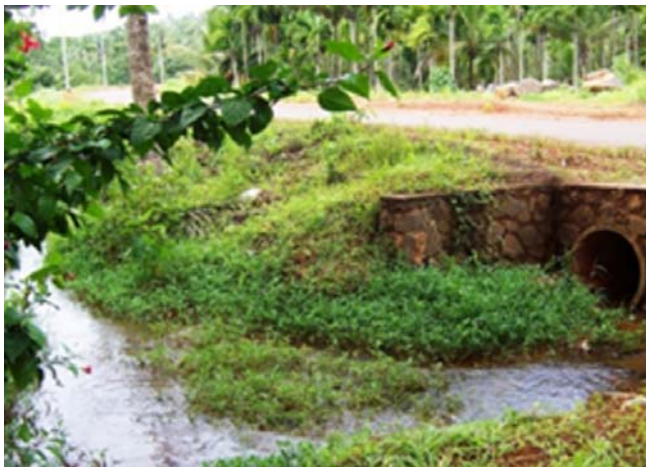
Storm-water discharging through culvert