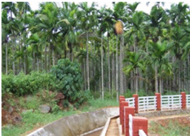
Storm-water bye-pass drain (lined)