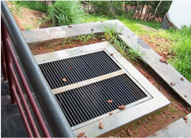
Roof-water collection manhole