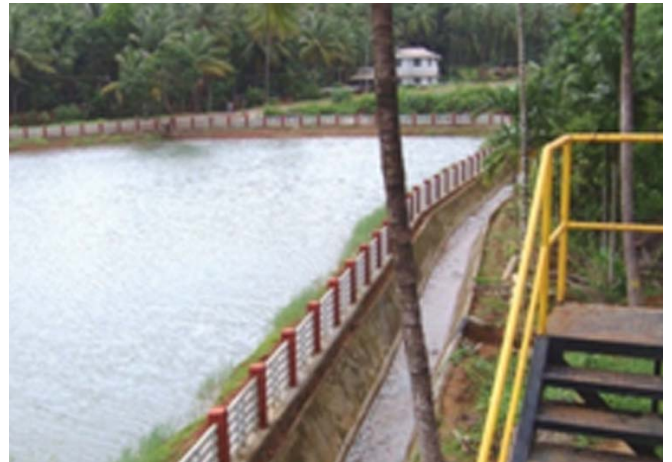
View of RWH Pond- 1 with overflow drain