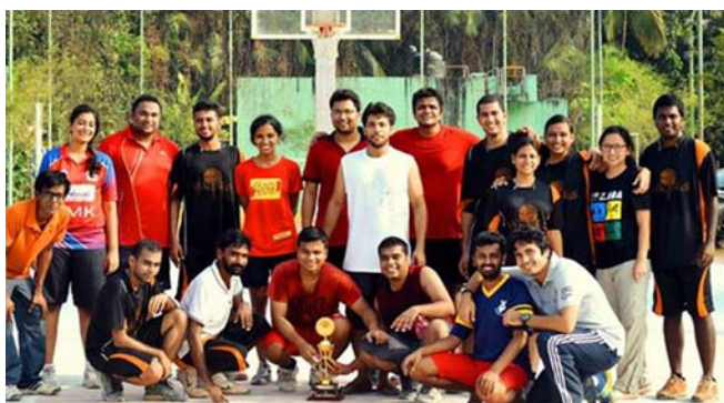
KBL Finalists with trophy