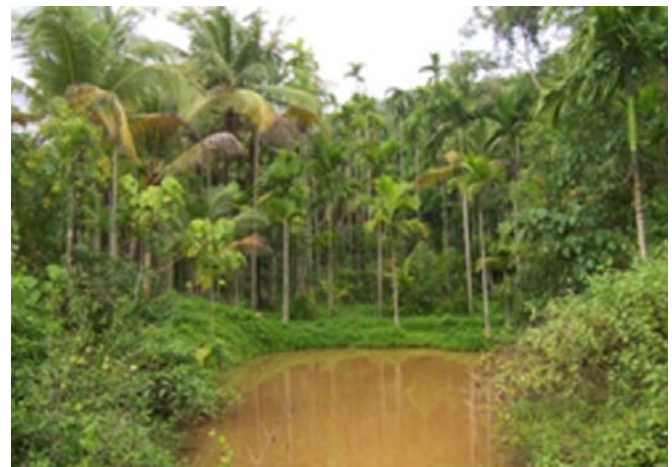
Water collected in inundation/re-charge area