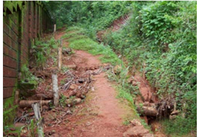
Stabilized storm-water unlined drain